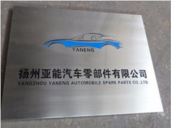
ABS plastic sheet supplier