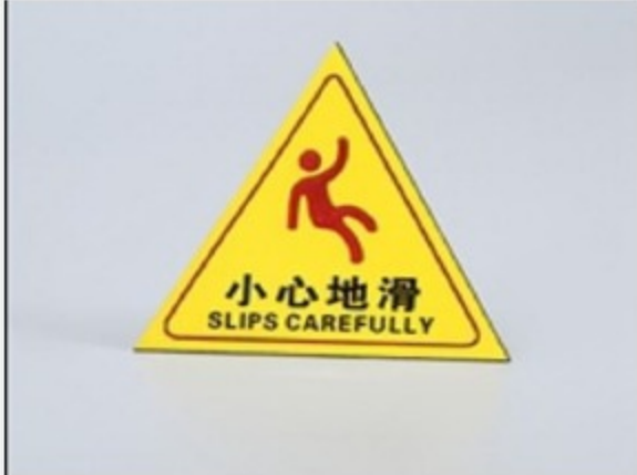
ABS sheet supplier