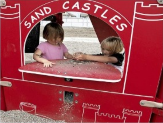
Sheet of ABS