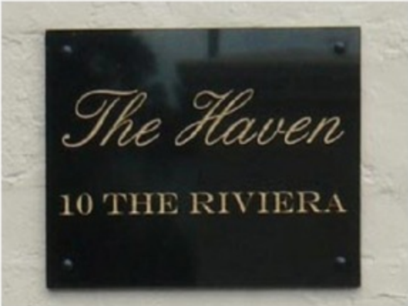
ABS plastic sheet