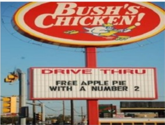
plastic of ABS sheet