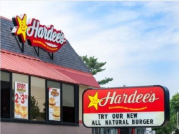
ABS double side color sheet