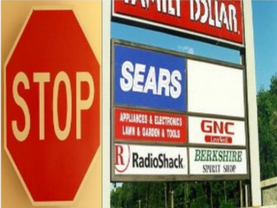
ABS board sheet