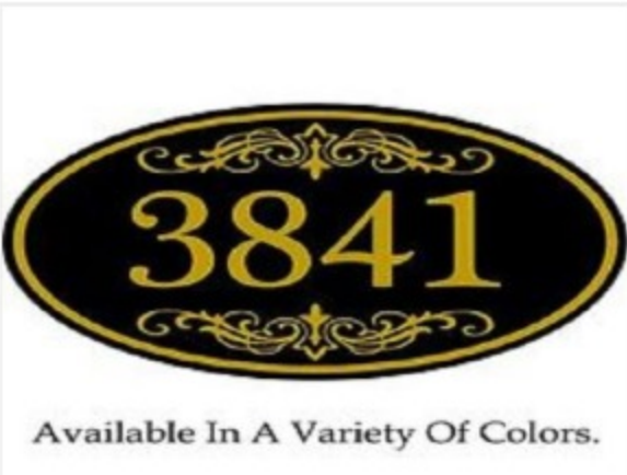
ABS board for sign