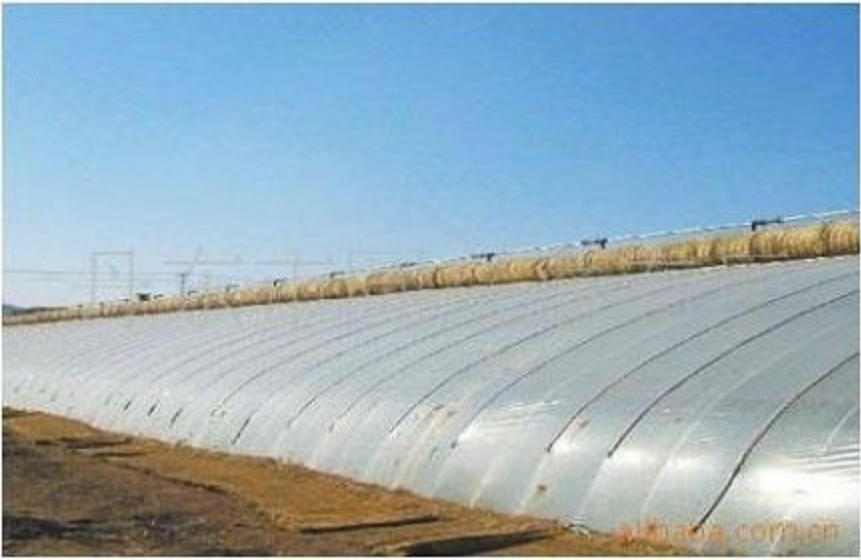
Agriculture PVC tarpaulin