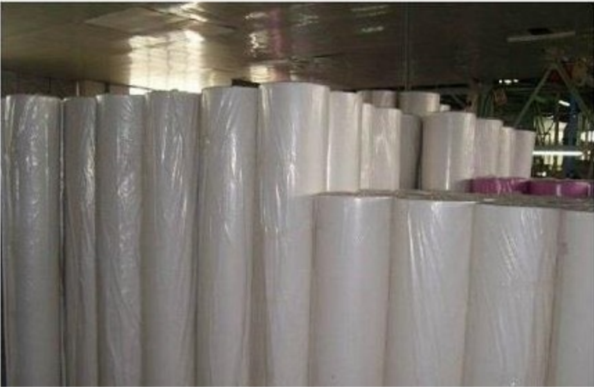
PVC film rolls