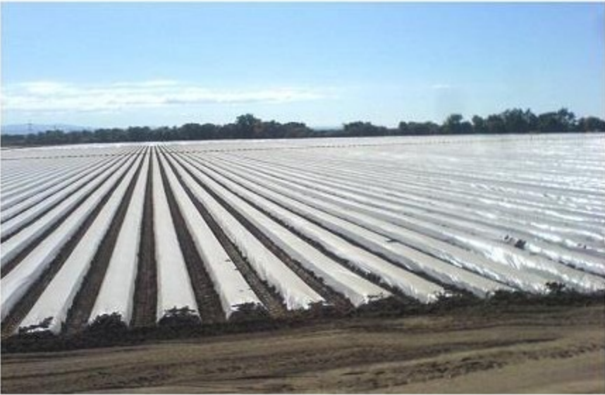
Agriculture shed tarpaulin