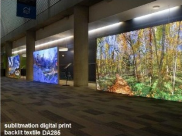
dye sub fabric for light box