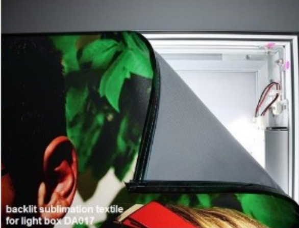
dye sub fabrics