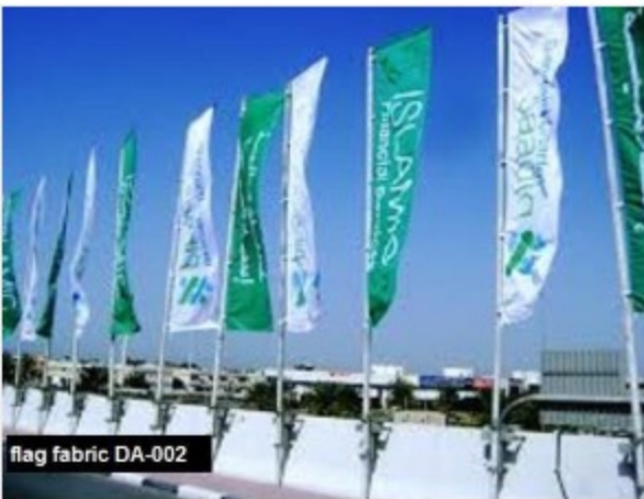
sublimation textile flag

Founded in 2001 , DERFLEX is a high-tech enterprise with all vitality , potential and comprehensive strength .The company is located in the Shanghai and Zhejiang area,a unique place with beautiful scenery and gifts of nature.