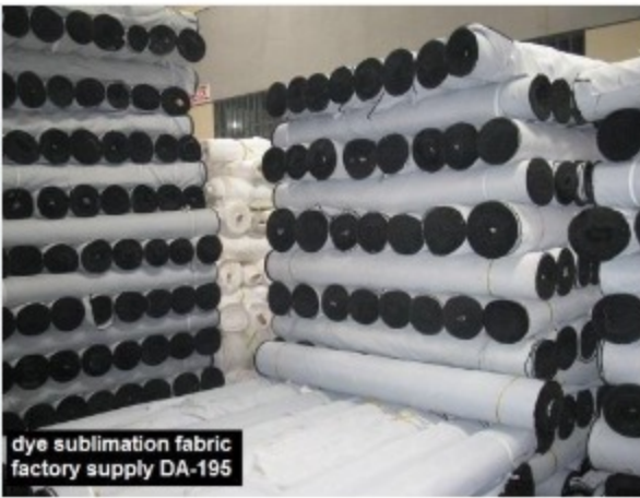
large format fabric printing rolls

DERFLEX main sublimation textile products as following: