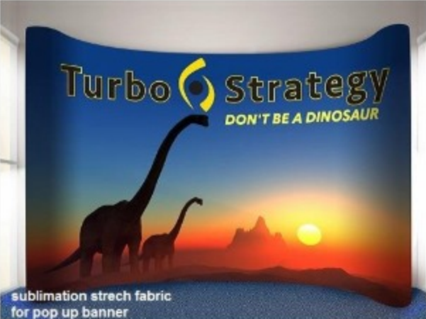
sublimation stretch fabric