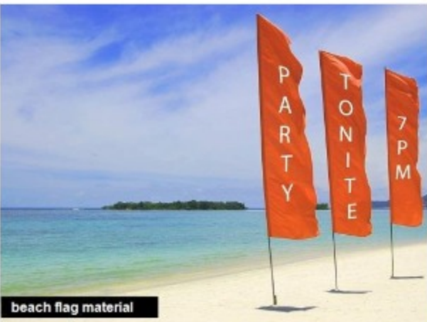
sublimation textiles for beach flag