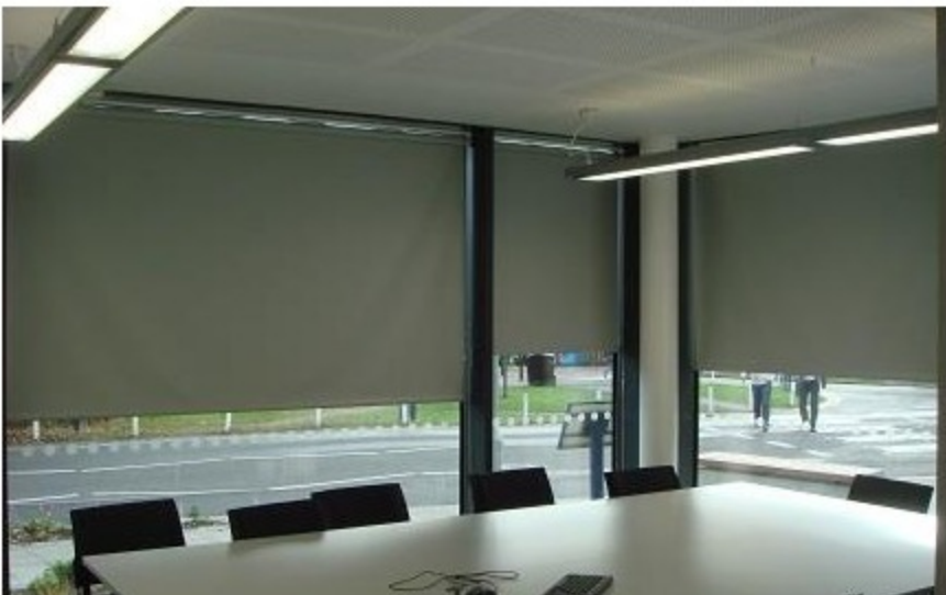
Rollup windows curtain