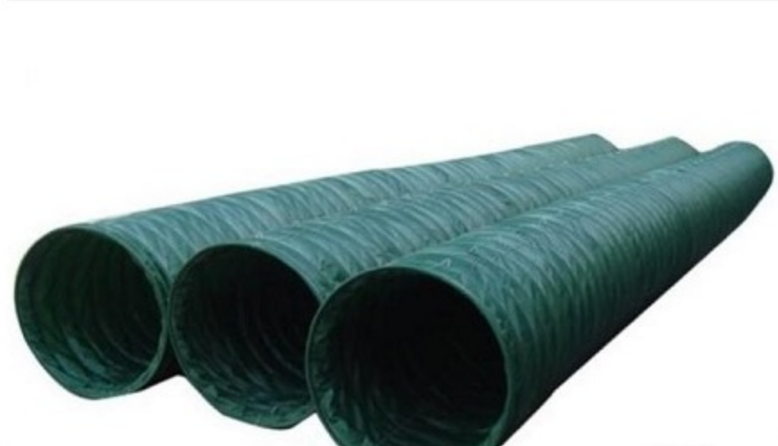
ventilation tube for mining industry

DERFLEX main tarpaulin material products for mining industry: