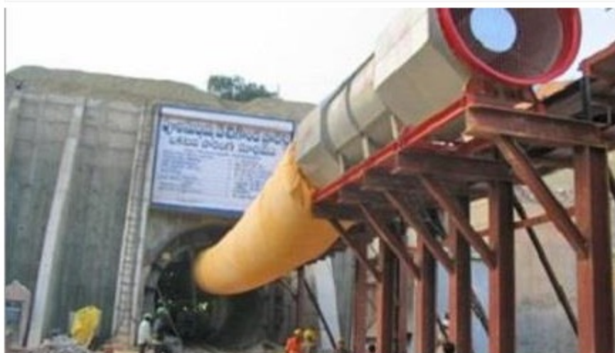
mining ventilation system