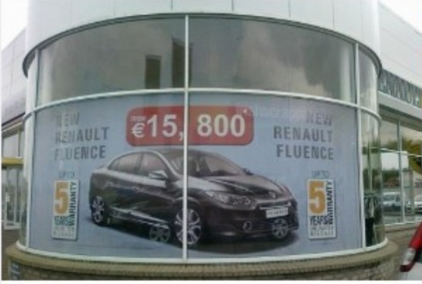
one way vision film for widow advertising