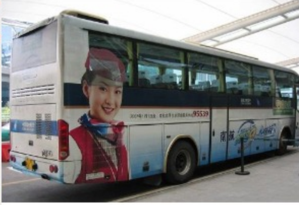
perforated window vinyl for car window sticker

Founded in 2001 , Shanghai DER New Material Co., Ltdis a high-tech enterprise with all vitality , potential and comprehensive strength .The company is located in the Shanghai,a unique place with beautiful scenery and gifts of nature. On the basis of technology development , the company has taken in a group of experienced personnels who are talented in senior management ,marketing and skills of producing .In the company ,great attention is paid to basic management ,stable quality ,continuously improving pre-sale services,sale and after-sale services,and enhancing the market competitiveness of our products. Main products of our company : PVC banner, self adhesive vinyl, one way vision film, perforated vinyl film, perforated window vinyl , etc. Since its foundation ,the company keeps living up to the belief of :” honest selling ,best quality ,people-orientation and benefits to customers. ” We are doing everything to offer our customers with best services and best products .We promise that we’ ll be responsible all the way to the end once our services begin.