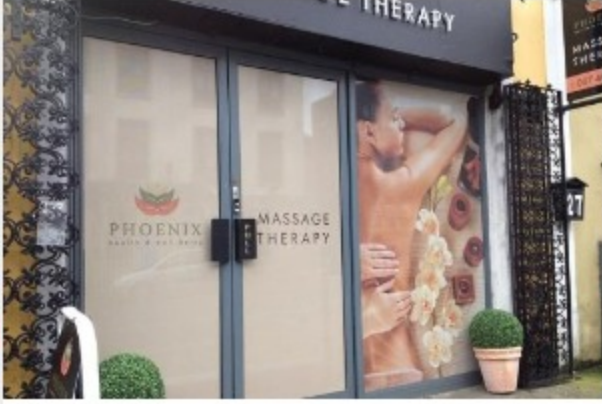
perforated vinyl film for windows decoration