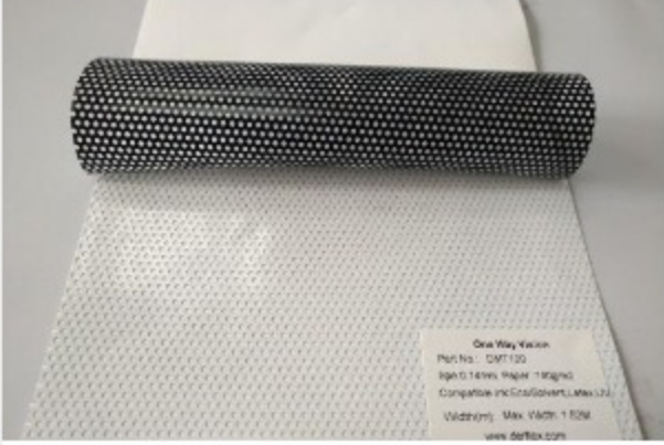
one way vision film