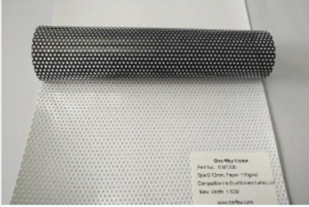
perforated vinyl film