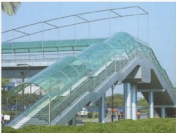
pc plastic board