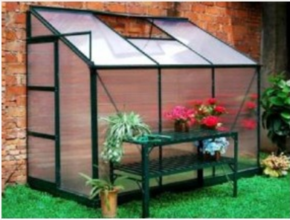
PC transparent sheet