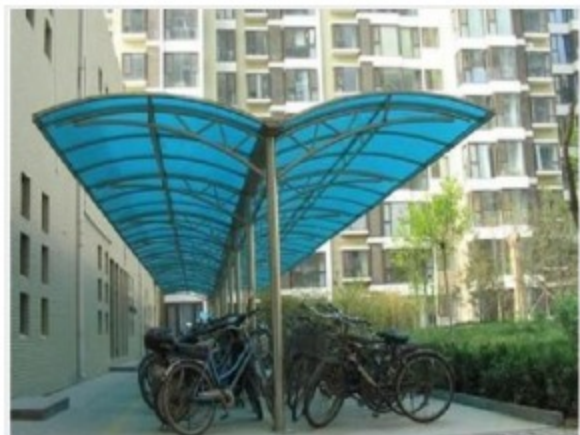
PC sheet supplier