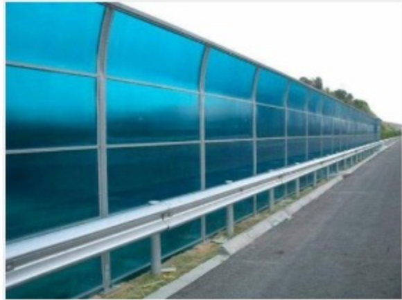
PC sheets supplier

PC sun board sheets are widely used in outdoor building lighting projects, such as: sports venues, stations, airports, shopping malls building lighting projects; corridor aisle roof, shelter, awning, parking, agricultural greenhouses, ecological restaurants; Advertising light boxes, highway noise barriers, indoor and outdoor decoration and other fields.