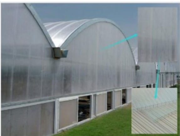
PC transparent sheet