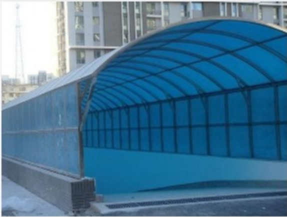
PC board panel