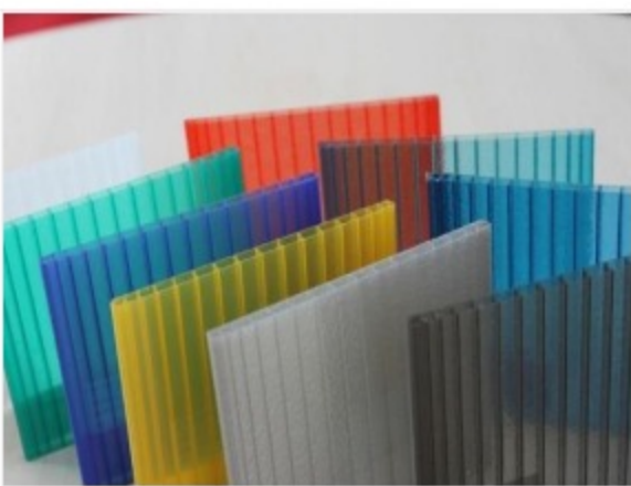
PC plastic sheet