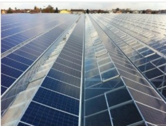
PC sun board

DER is professional PC sheet manufacturer, our products are in promotion. If you are distributor of PC board sheet , or PC plastic sheet , and if you have any questions or requirement of pc sun board, please contact us freely.