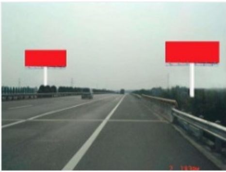
billboard banner material