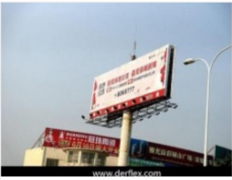
frontlit banner for city billboard

DERFLEX laminated banner advantage: 1. factory price 2. professional technical support, 100% following customer order. 3. complete QC system, to promise the quality of the final products.