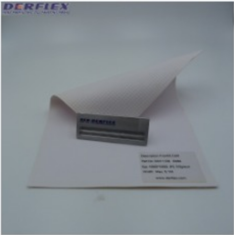
1000D frontlit banner fabrics