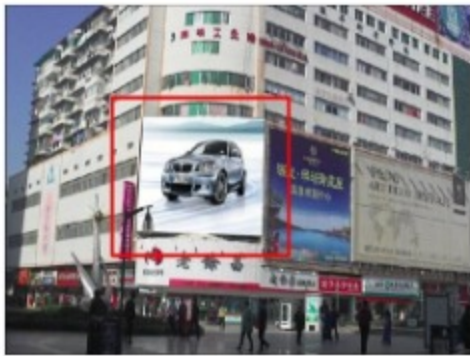
frontlit banner for outdoor advertising