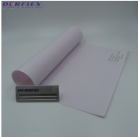
laminated frontlit banner material

Application: Outdoor billboard printing, outdoor advertising