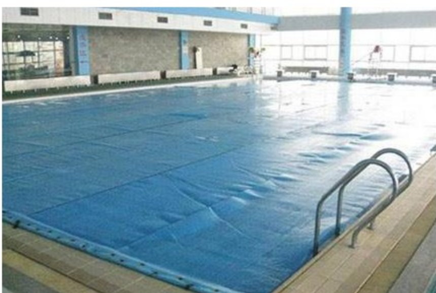
Swimming Pool Covering Tarpaulin