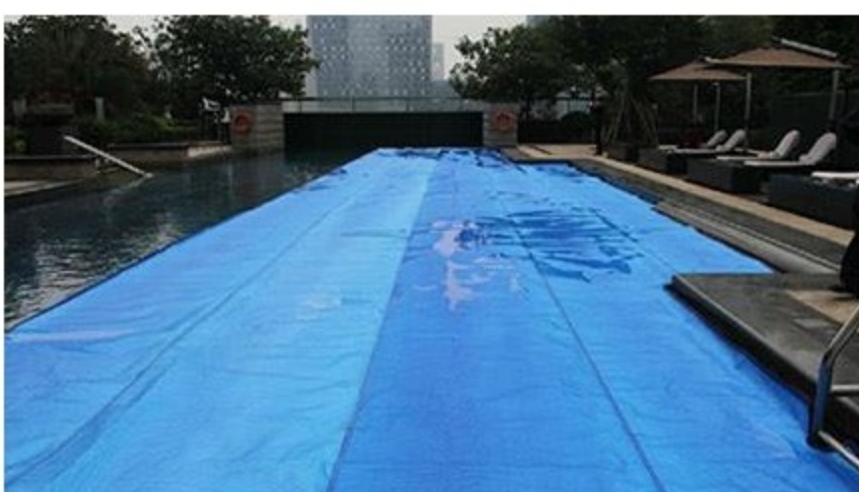
Swimming Pool Covering Tarpaulin