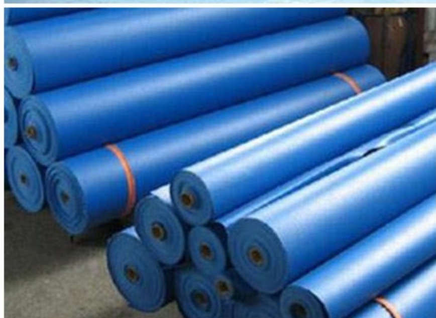
Swimming Pool Covering Tarpaulin